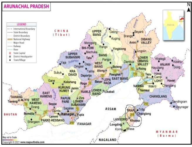
Fig. 1: Map of the State and Study area District in circle.

The peduncle length and grain weight resulted having positive correlation among each other. Namsang was recorded maximum peduncle length (12.47 cm) & eight of thousand grains (2.06 g) followed by Khetibasti landrace (8.21 cm and 1.48 g respectively) while the Lazu